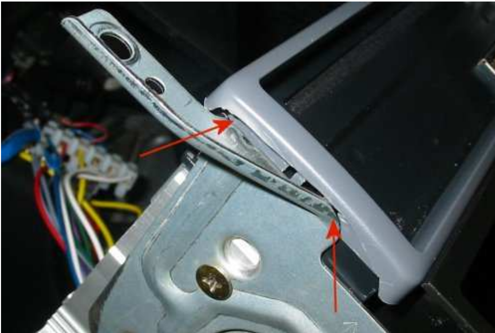
The sides of the surround needed to be removed (carefully with a chisel) so as to clear the edges of the mounting bracket.